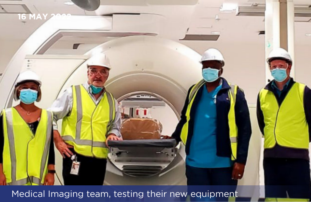
Medical Imaging team, testing their new equipment