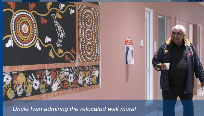
Uncle Ivan admiring the relocated wall mural