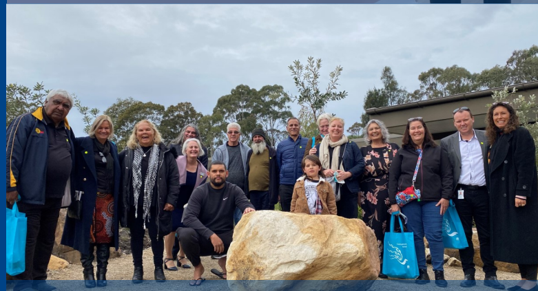
Aboriginal Elders and community visiting the Healing Circle