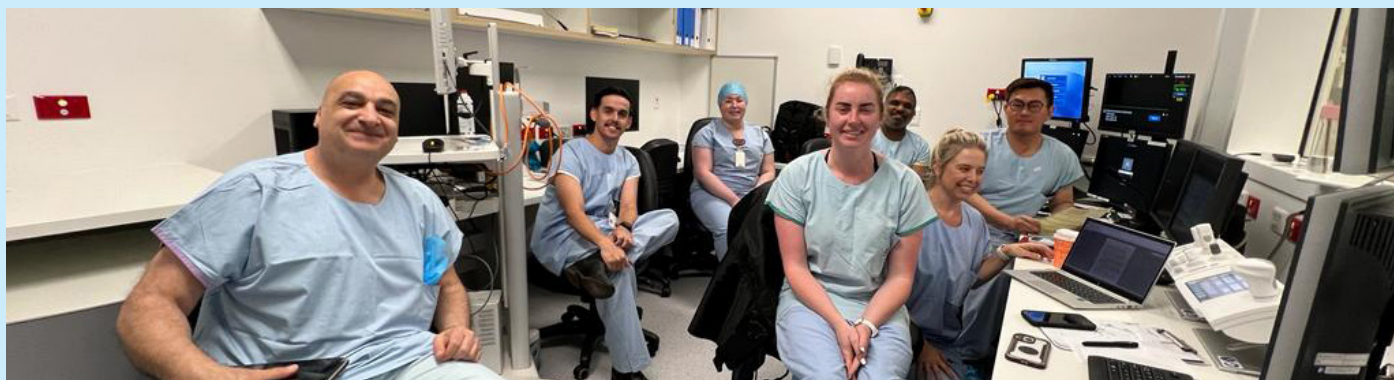
The team come together in the control room for the commissioning of the new cath lab.