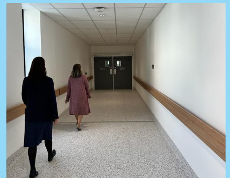
Staff using the new link bridge to Building D.

Now providing a more direct internal pathway between the Emergency Department (Building A), Medical Imaging (Building C) and Building D, the new bridge means that staff are now able to move more quickly around the hospital as needed. "Having direct, back of house access linking these buildings allows for improved response times when timeliness is critical," MET Coordinator Matthew Laird said.