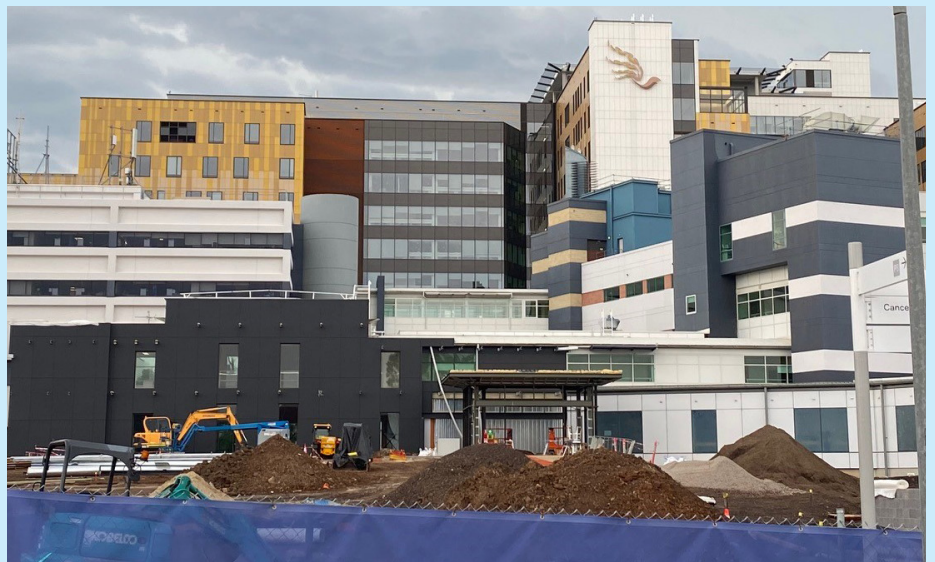
Northern entrance under construction.