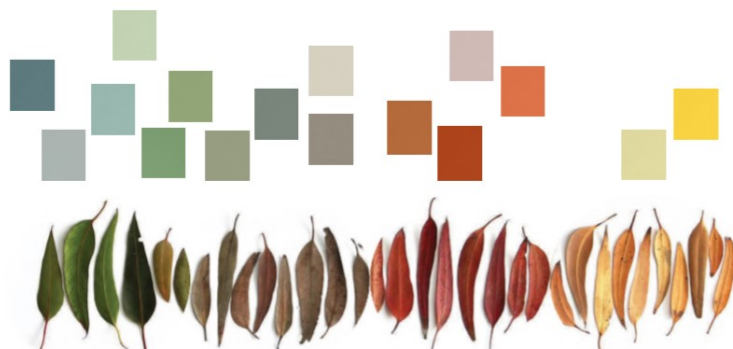
The project's colour palette, inspired by native flora of the region.

Intensive Care Unit – the sweet sarsaparilla. This plant's leaves have a well known medicinal value, used to treat coughs and respiratory ailments. The new leaves can be sucked to ease a sore throat, and the leaves and stems act as a general tonic said to relieve inflammatory symptoms associated to colds, flu, coughs, bronchitis, arthritis, rheumatism and diabetes.