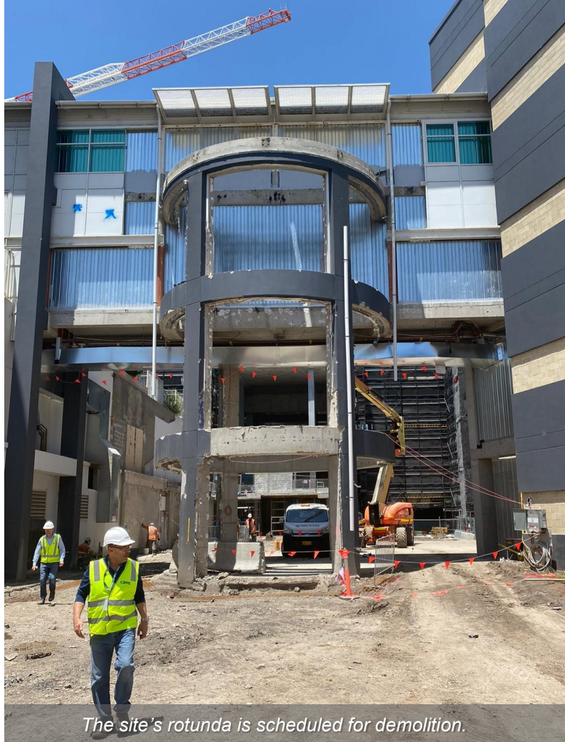
The site's rotunda is scheduled for demolition.

A brand new dental unit – a first for Campbelltown Hospital, will also be delivered.